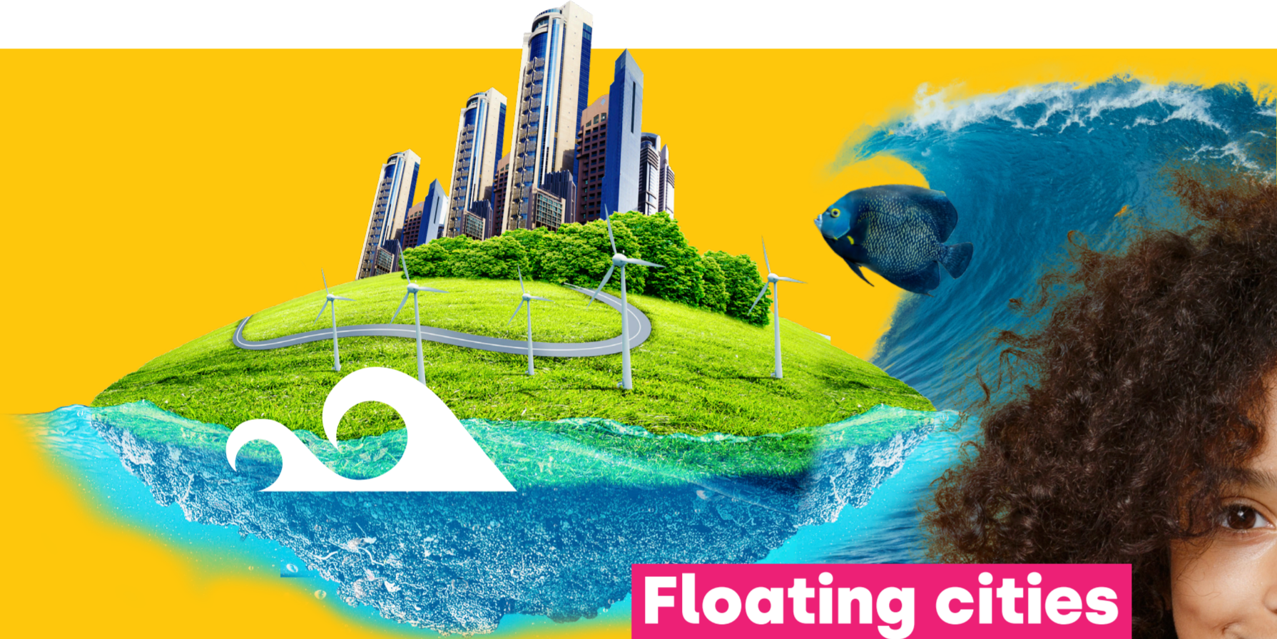
Floating cities in the ocean